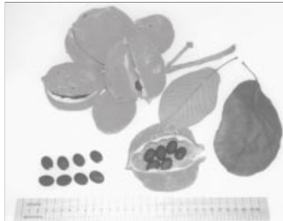
Figure 1 Sterculia cordata seedpods and seeds

This paper reports, for the first time, cryopreservation of S. cordata embryos. Excised embryos were used due to larger size (2 cm height and 1.5 cm diameter; Figure 1) and high shedding moisture content of seeds (29% on fresh weight basis). Different seed developmental stages (SDS) were studied for cryopreservation. Seed developmental stage is a very important criterion in cryopreservation especially for non-orthodox seeds (i.e. intermediate and recalcitrant categories). This is because complex physiological changes take place as the seeds mature including changes in moisture content (Walters 1999). Moisture content is an important factor in