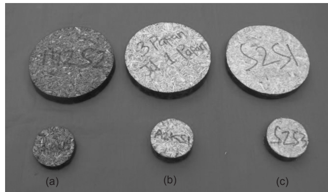
Figure 1 Sample materials for measurement of sound absorption coefficients, (a) acacia, (b) manii and (c) sengon particleboards

Results of this study showed that as density of the boards increased, MOR, IB, screw holding power and compaction ratio values also increased. Compaction ratio is the ratio of board density to wood species density. It is related to sufficient interparticle contact area which has a strong influence on board performance. A low-density wood provides a high compaction ratio, since