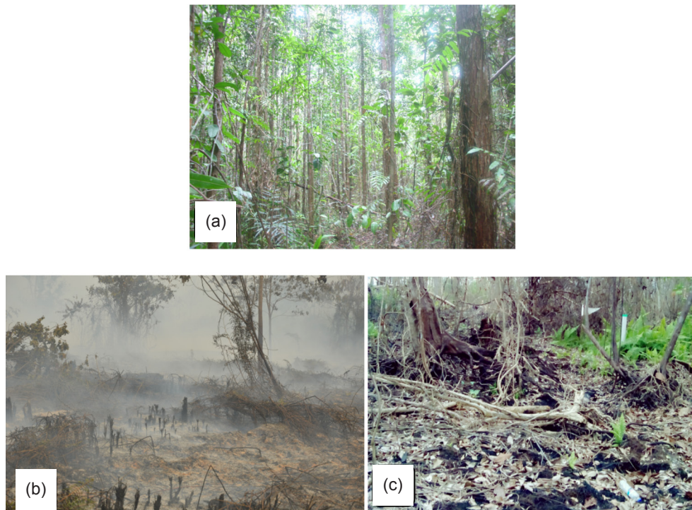
Figure 1 The Kubu Raya study site peatland forest: (a) before, (b) immediately after the wildfire in January 2014, and (c) two months after the wildfire

an auxiliary sensor interface terminal to assess soil surface temperature and water content at 10-cm peat depth. Twenty four points of collars were set up for measurement and data were taken weekly, averaging daily emission for 15 months. Annual peatland CO 2 emission was estimated from those measurements.